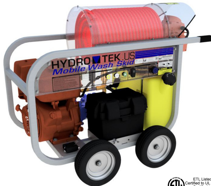
Shown with optional stainless steel frame